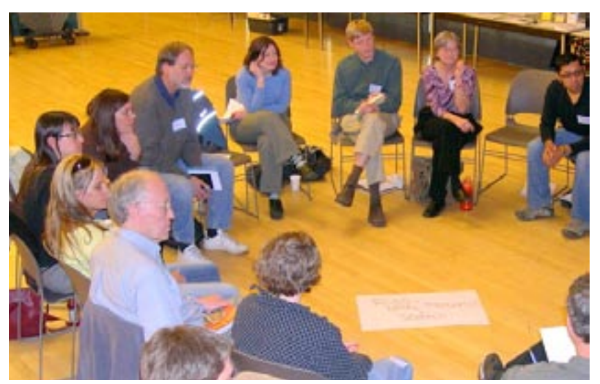
Food / Local Production Collaboration-for-Action Session