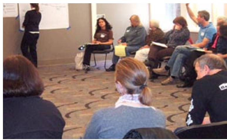
Sustainability Collaboration-for-Action Session