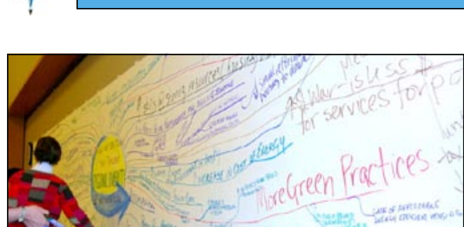
Mind mapping exercise at the 5th Annual Regional Livability Summit